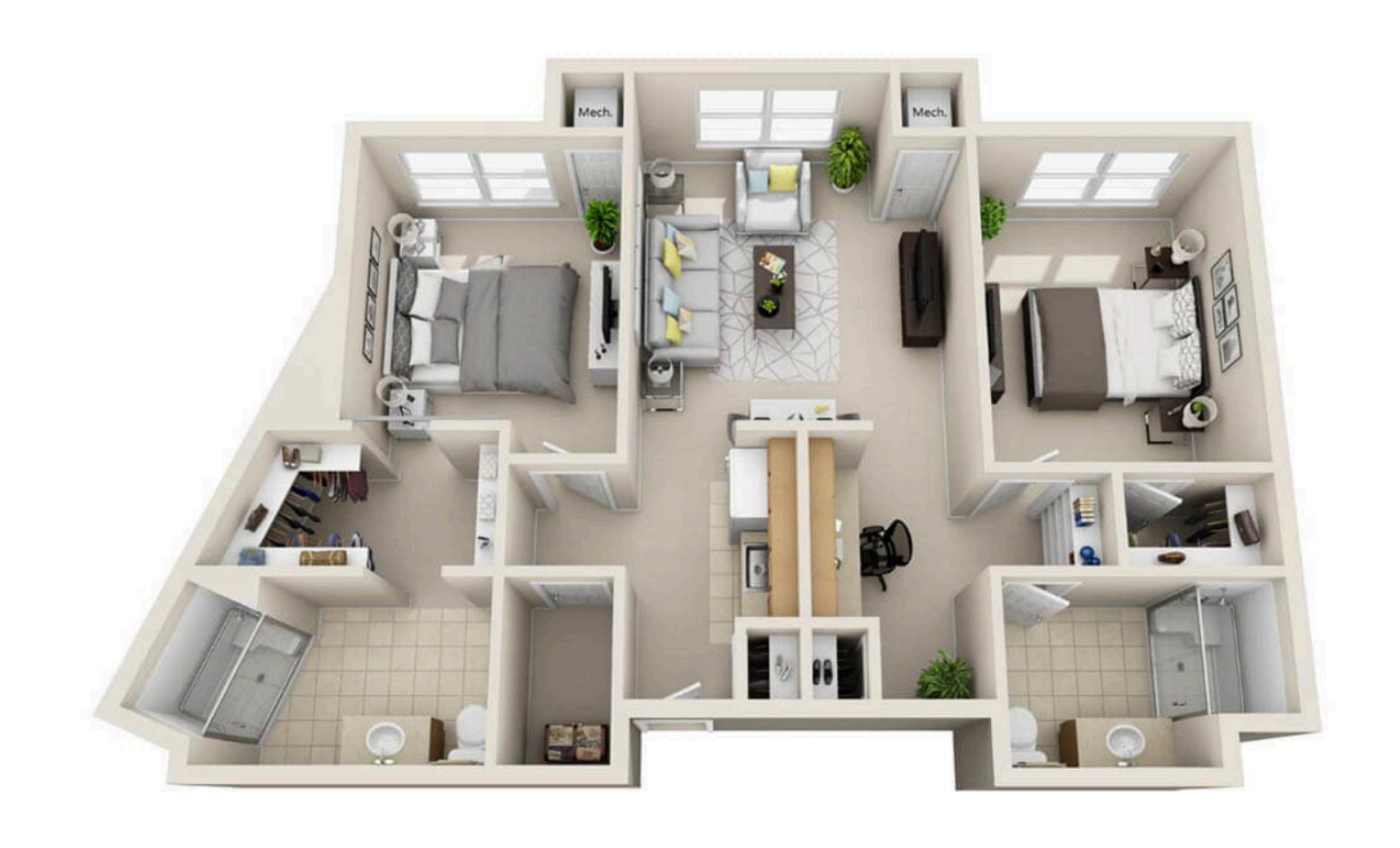
View All of Our Floor Plans